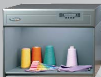
CAC60 Cabinet - 600mm