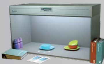
CAC120 Cabinet - 1200mm