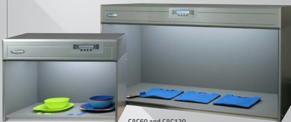
CAC60 and CAC120

The stability of our light sources give excellent viewing conditions for reliable colour critical decisions under standardised lighting. Ensuring agreement and consistency through global supply chains, helping to highlight product quality issues, such as Metamerism, at the earliest opportunity.