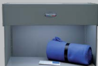
Portable cabinet - 600mm