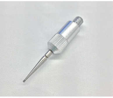
* The photo shows a needle with a holder. Holder is not included in a single needle purchase.

Designed with separator measurement in mind (size: ø1, 0.5R tip shape)